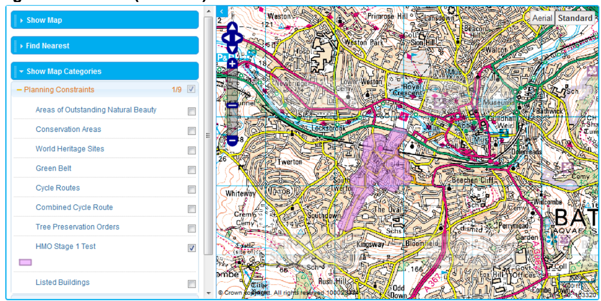
Figure 3: Current (30/04/14) iShare data on Council Website